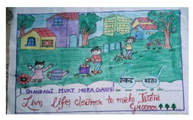
Nidhi Tangariya – VII