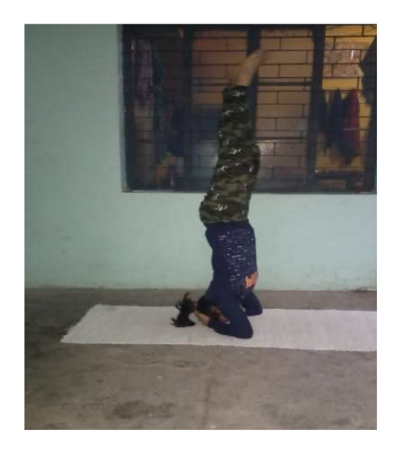
Girls performing various Asanas