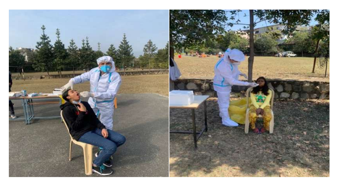
Medical Camp for Students