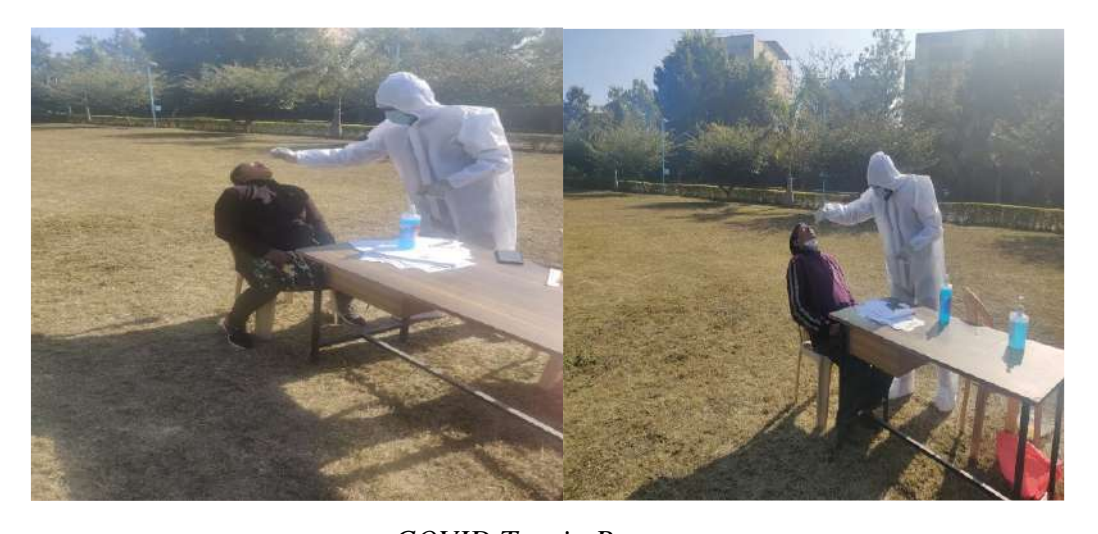
COVID Test in Progress

Altogether, 239 students out of 243 have returned to school. The remaining 4 girls, who are from Sikkim, will be returning soon. 35 students of Class V are continuing their classes from home.