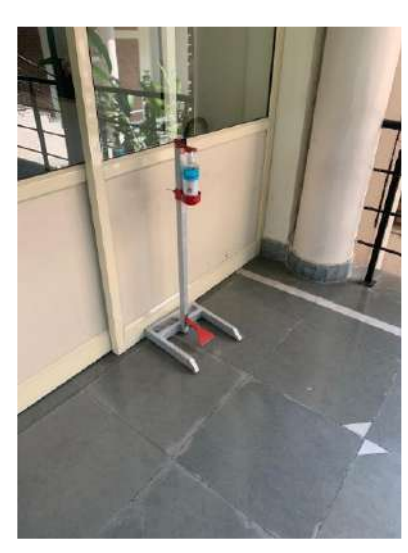
Hands-Free Sanitization Units